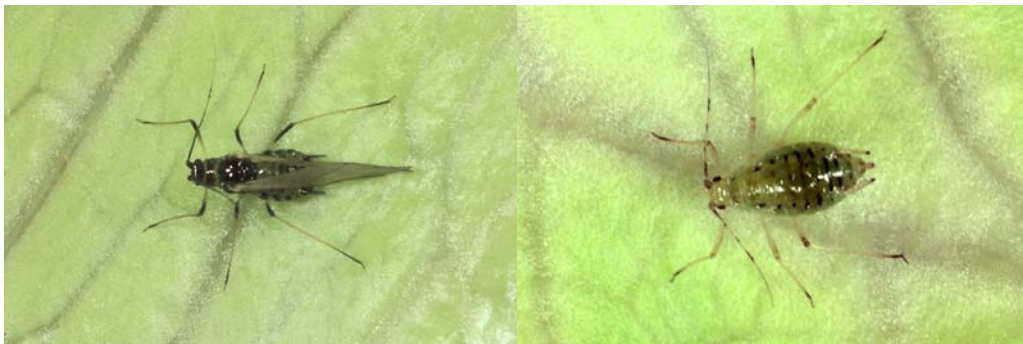
Winged lettuce aphid

The nymphs and wingless adults of the lettuce aphid are up to 2.7 mm long. They are yellow to green in colour with brown markings on the back of the adult. Winged adults are medium sized, 1.5-2.5 mm long, and pale yellow to green with dark brown/black markings on the back and legs. A pink form is known overseas but has not been seen in New Zealand so far.